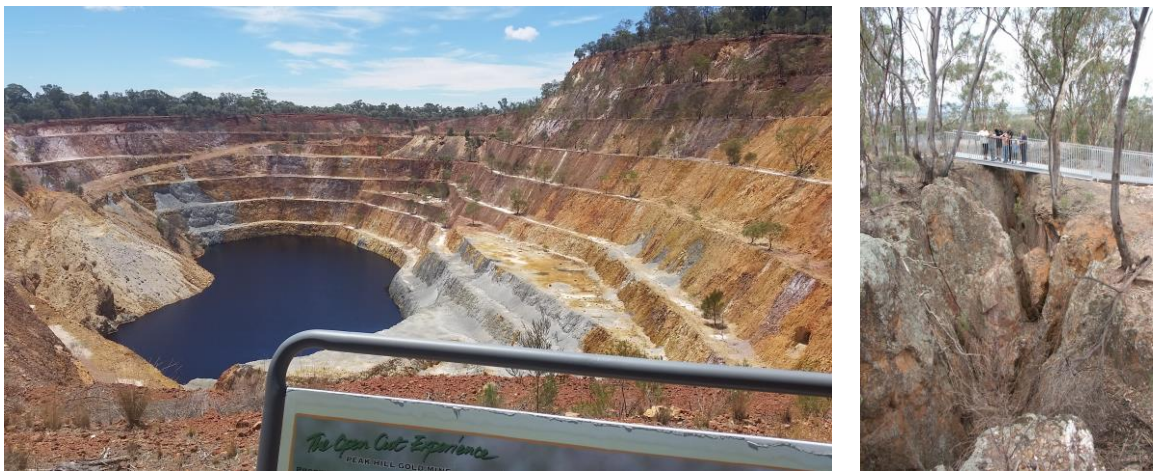
Figure 1: Peak Hill Open Cut Gold Mine Experience

This site is 95% rehabilitated to a stable final landform with multiple uses. The Mining Leases are still in place as potential to mine gold one day in the future still exists. The Open Cut Experience is a tourist mine just a few hundred metres east of the Newell Highway. Interpretive signs explain historic and modern mining techniques to visitors in a pleasant bushland setting.