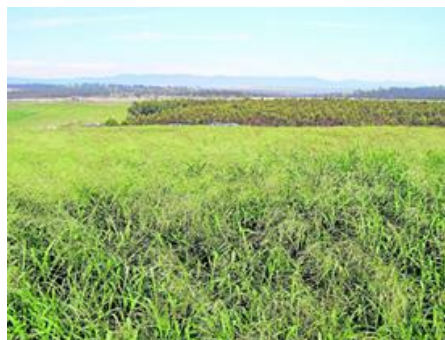
Figure 6: Rehabilitation trials involving organic waste by-products at Rix's Creek.

The biosolid amended plot also produced the comparable green leaf production and more than 4 times greater metabolisable energy after 24 months. Indicative pasture productivity and stocking rates are approximately two to three times higher than native pasture. The trial demonstrates the benefits of biosolid amendment to low-fertility soils.