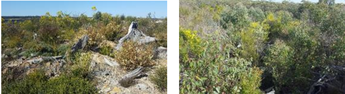
Figure 4: Examples of rehabilitation after 2 years (left) and 8 years, showing dense cover of canopy species at South 32 Illawarra.

The waste areas undergo specific surface reshaping, in order to mimic micro-topographic features. Stripped soil layers are immediately redistributed to donor sites to allow maintenance of the inherent nutrient value and soil seed bank to the soil. Native seeds are collected locally and are spread over completed emplacement areas to supplement the seed bank.