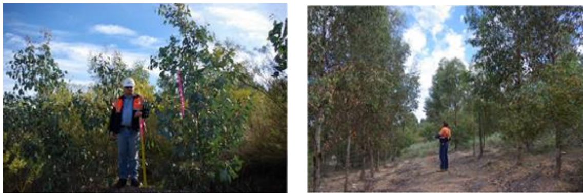
Figure 2: Rehabilitation progress at 2 years (left) and 7 years (right) at Boggabri Coal Mine.

Four rehabilitation plots (4, 5 and 7 years old) were surveyed for birds, invertebrates, bats and vegetation. A BioBanking survey was also conducted at each site. Biobanking is a framework established by NSW government assessment for management of biodiversity offsets.