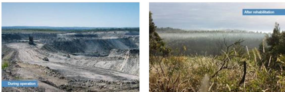
Figure 3: Before (left) and after (right) closure of the Westside open cut coal mine.

The mine closure plan included retaining the void associated with the open cut mine. The void will fill with water fed by rainfall runoff and groundwater. Modelling has indicated it will take 17 years to fill the void (2029) at which time flows will be returned into an adjacent creek with water quality similar to background levels. A long-term monitoring program has been designed to confirm modelling results.