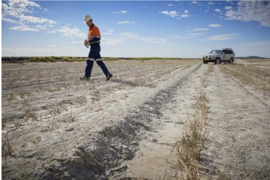
Figure 7: Barley cropping trials on tailings at Northparkes.

Planting a crop directly on tailings dams to manage dust is an industry first, and consequently, the outcomes were unknown. However, the results of the barley crop and other dust management techniques speak for themselves. There has been no dust lift-off from the areas of the tailings dams included in the trials since sowing in April 2016. Today, barley covers 65 per cent of the tailings dams and Northparkes has significantly reduced the chance of future dust lift off for the community.