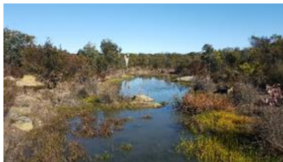
Figure 5: Waterhole constructed in 2007 to provide fauna habitat at South 32 Illawarra.

Many species have seeded multiple times and young germinates are evident. This indicates that the stand will be self-sustaining over time and seed fall will provide insurance if the area is inadvertently burnt in a wildfire.