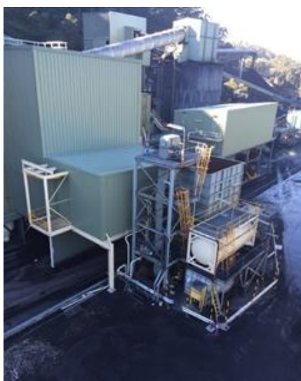
Figure 8: Surface UG Emplacement Backfill Plant Construction Complete July 2016 at Peabody Energy.

Following emplacement of CWR and optimisation of systems performance, work is scheduled for upgrades to the plant in 2018 to allow the disposal of 100% of CWR underground by 2021.