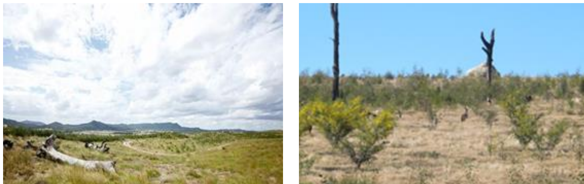
Figure 11: Natural landform rehabilitation at Mangoola Coal

Following a successful trial in December 2012, the mine revised final landform plans for the entire footprint of the mine. To date, the natural landform rehabilitation covers over 250 hectares, and this will continue to grow.