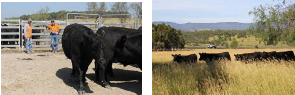
Figure 10: Grazing trial steers yarded for regular weighing (left) and rehabilitated mine land at Hunter Valley Operations used for grazing trials.

In addition to the grazing trials at Mt Arthur Coal (BHP Billiton), these projects have provided industry with an indication that with high quality rehabilitation practices the grazing of cattle on rehabilitated mined land could be commercially viable and may provide superior pasture compared to surrounding unmined paddocks.